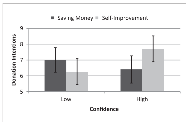
Figure 2. Intentions to donate to charities as a function of goal prime and confidence conditions

Charity donation intentions. Following the above inductions, participants viewed three brief print advertisements for